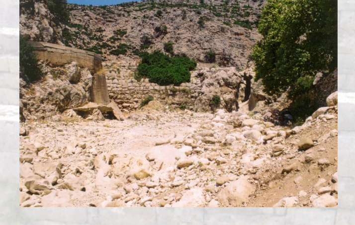
22 - 24 March 2014 Patras, Greece